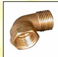
CODO BRONCE HI-HE