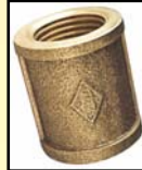
COPLA BRONCE HI HI