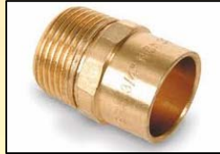
TERMINAL BRONCE SO-HE