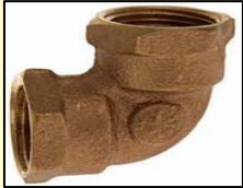
CODO BRONCE HI-HI