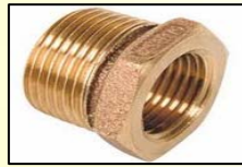
BUSHING HE HI