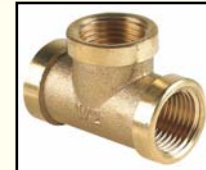
TEE HI HI HI