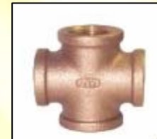
CRUZ BRONCE SO