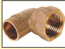
CODO BRONCE SO-HI