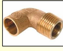
CODO BRONCE SO-HE