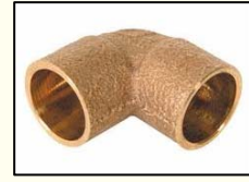
CODO BRONCE SO-SO