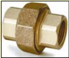
UNION AMER. SO-HI