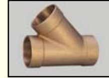
VEES BRONCE SO SO SO