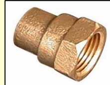
TERMINAL BRONCE SO-HI