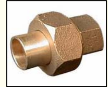
UNION AMER. SO-SO