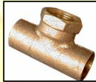
TEE BRONCE SO SO HI