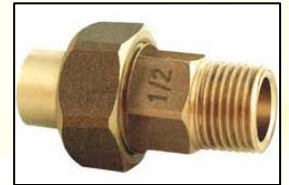
UNION AMER. SO-HE