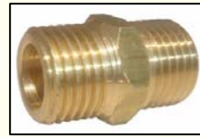
NIPLE HE HE