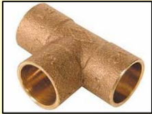
TEE BRONCE SO-SO-SO