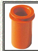
SALIDA DE CAJA