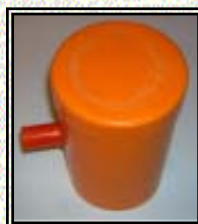
CAMARA DE REGISTRO