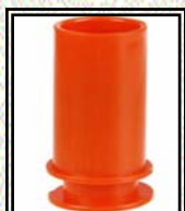
TERMINAL DE CAMARA