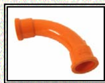
CURVA 45° CEM