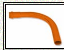
CURVA 90° ANGER