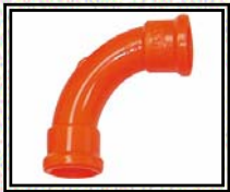
CURVA 90° CEM