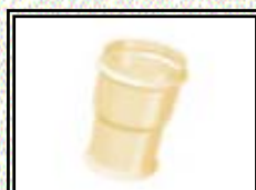
TERMINAL DE CAMARA ANGER