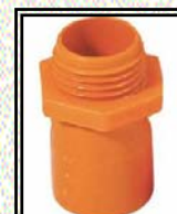
TERMINAL CAMARA HE