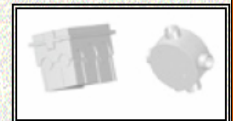
CAJAS Y OTROS